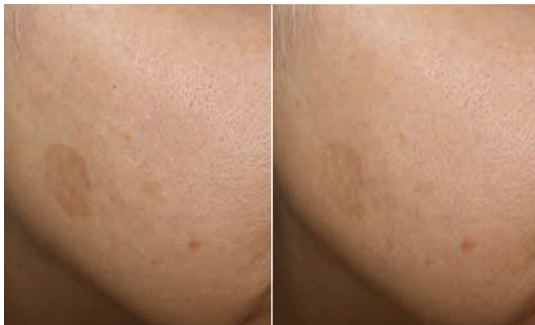
Female Caucasian Age 61 Fitzpatrick Skin Type III

Unretouched photos taken in standard 1 lighting of subject at baseline and week 4 after use of Even & Correct Dark Spot Cream.