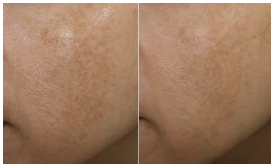
Female Asian Age 51 Fitzpatrick Skin Type III

Unretouched photos taken in standard 1 lighting of subject at baseline and week 12 after use of 4% hydroquinone on the other side of their face.