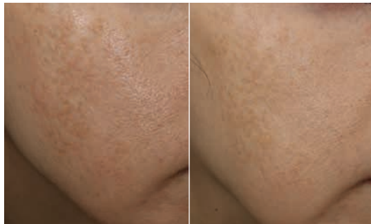
Female Asian Age 51 Fitzpatrick Skin Type III

Unretouched photos taken in standard 1 lighting of subject at baseline and week 12 after use of Even & Correct Advanced Brightening Treatment on one side of their face.