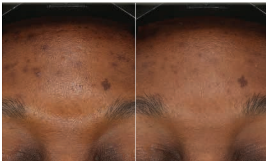
Female African American Age 38 Fitzpatrick Skin Type V

Unretouched photos taken in standard 1 lighting of subject at baseline and week 12 after use of Even & Correct Dark Spot Cream.