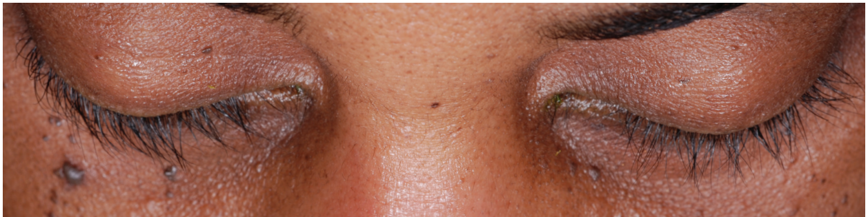
AFTER-Week 16, no mascara

Results may vary. Paid user. PRESCRIPTION ONLY. Unretouched, real lashes. No extensions. No lash inserts.