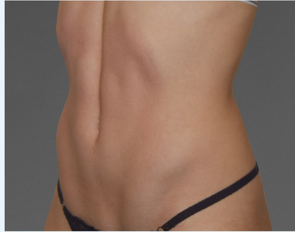
Immediately After 4th CoolTone™ Treatment