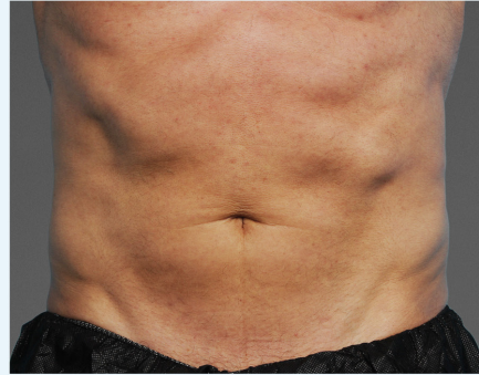
Immediately After 4th CoolTone™ Treatment

Individual results and patient experiences may vary.